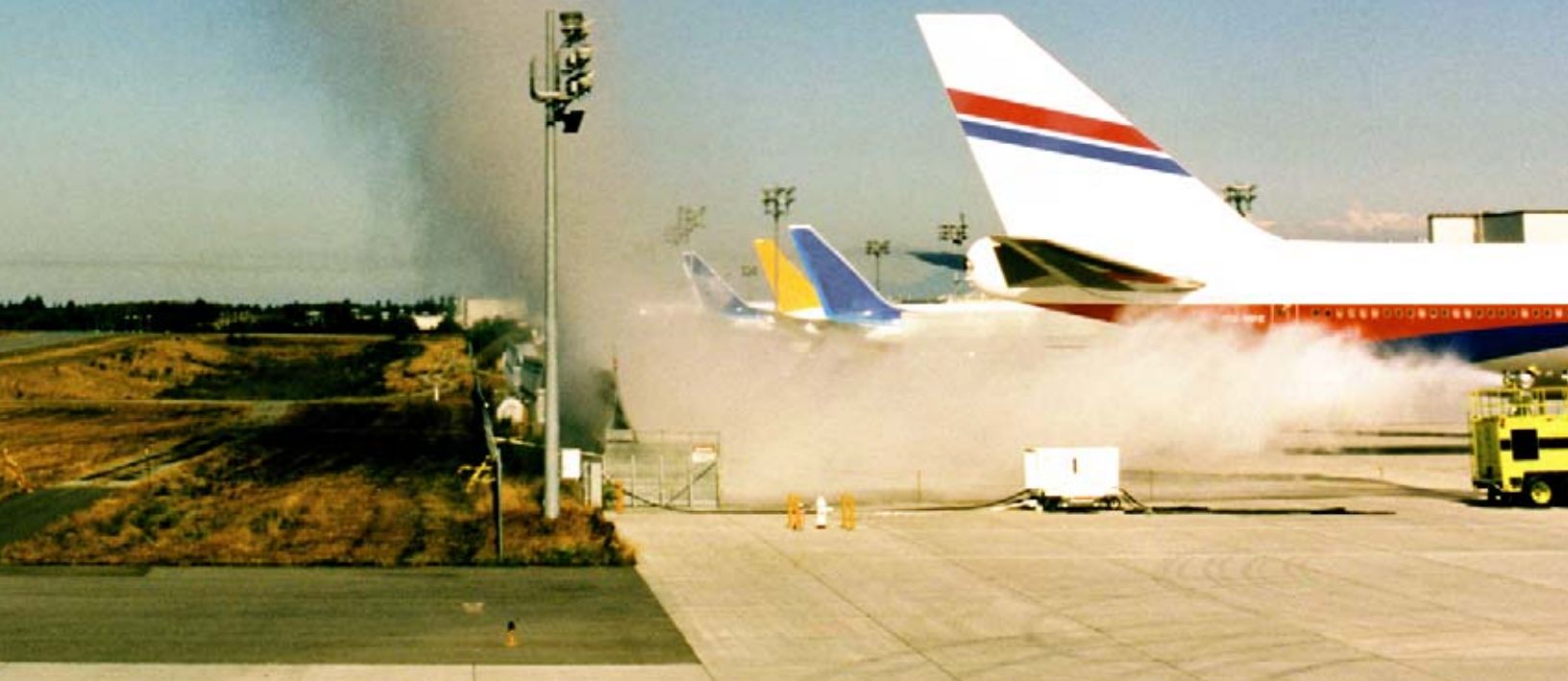
FULL-POWER TESTING OF A BOEING 747-400 USING WATER TO DEMONSTRATE THE PERFORMANCE OF THE DEFLECTOR.