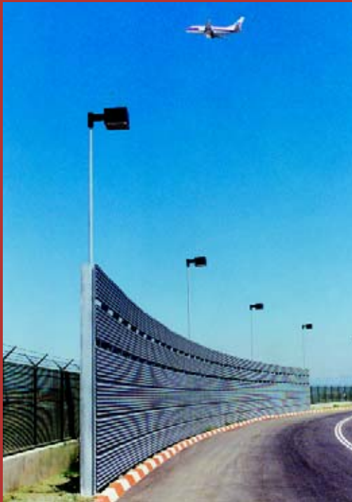
V14 blast fence installation at Los Angeles International Airport.