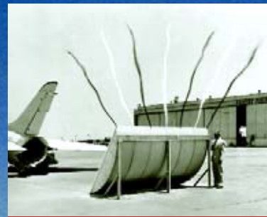
EARLY TESTING OF LYNNCO TYPE E DEFLECTOR.

For nearly five decades, BDI has conducted extensive testing to advance and refine our line of jet blast deflectors.